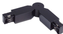
F - Flexible connector