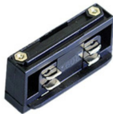
C - concealed connector