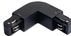
LL - Left L connector LR - Right L connector