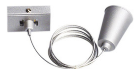
SB - Suspended with fixing bracket