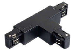
T - T connector