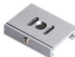
FB - Fixing bracket